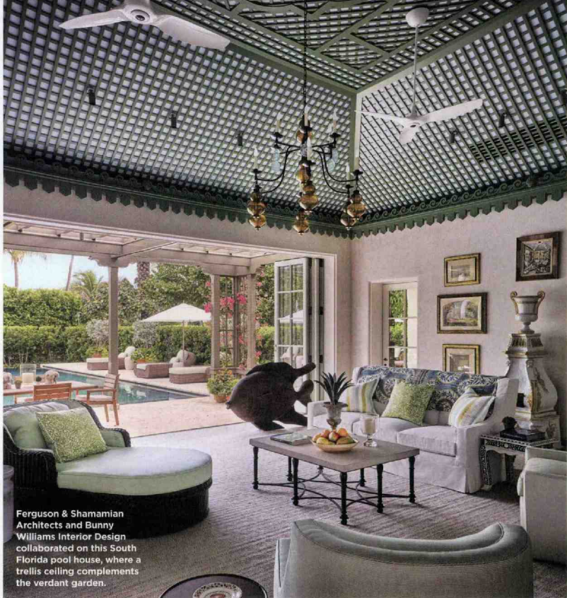
Ferguson & Shamamian Architects and Bunny Williams Interior Design collaborated on this South Florida pool house, where a trellis ceiling complements the verdant garden.