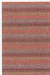
MISSONI Salerno rug from STARK ; starkcarpet.com