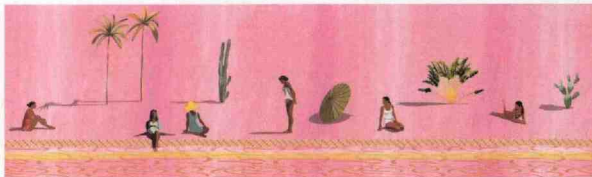
Venus Panoramique wallpaper by ÉLITIS; elitis.fr

CLOCKWISE FROM TOP: FRANCESCA IANESCHI; COURTESY OF WALKER ZANGER; COURTESY OF ÉLITIS; COURTESY OF ARTERIORS; COURTESY OF ESKAYEL; COURTESY OF WILDWOOD; COURTESY OF CENTURY