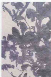
Up for Anything wallpaper by ESKAYEL; eskayel.com