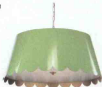
Mirasol pendant by MEG BRAFF for WILDWOOD; wildwoodhome.com