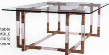
Corset coffee table by CELERIE KEMBLE for ARTERIORS; arteriorshome.com