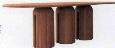
Oco dining table by JORGE ARTURO IBARRA for LUTECA ; luteca.com