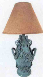
Lamp by ANTONINO PISCITELLO from SUD ; sudneworleans.com