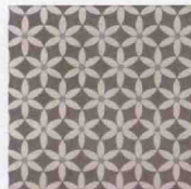
Encaustic Echoes Bloom porcelain tile by WALKER ZANGER; walkerzanger.com