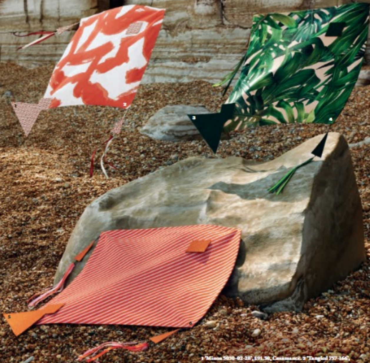
1 "Minoa 5030-02-2B", £91.90, Casamance. 2 "Tangled 757-166", by Porter Yelen, £245. 3 "Silky 605-347", £191; both Perennials. 4 "Ganglia ETR-6602-001-2", by Etra, £175.80, Tarnell & Gigon. 5 "Salt Marsh FRL5151-01", by Ralph Lauren Home, £99, Designers Guild. 6 "Strange Loves T19044-006", £151, Dedar. Prices are per m and include VAT. For suppliers' details see Address Book p. 14