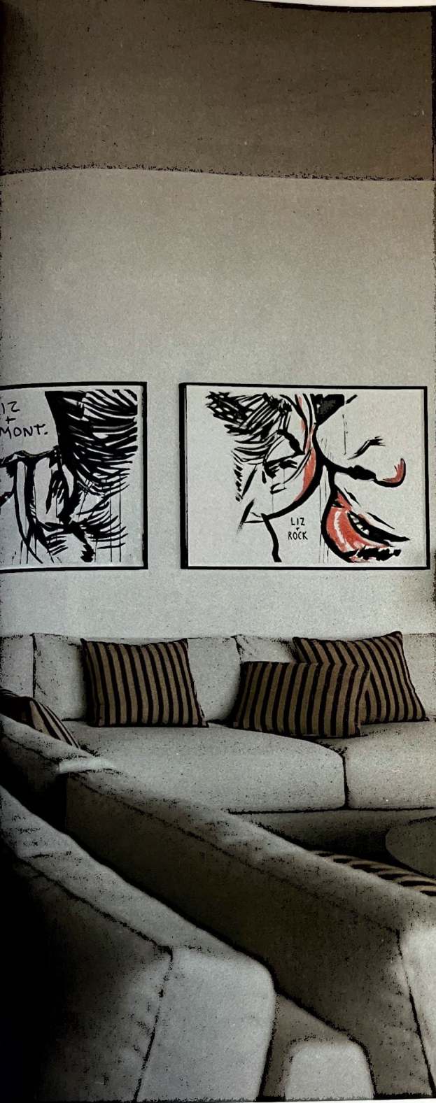
ABOVE: In the media room, the custom sofa is covered in a Rogers & Goffigon linen. Throw pillows in an Aissa Dione fabric; artworks by Raymond Pettibon.